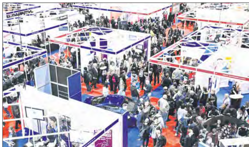
Photo of the National Apprenticeship Show, Arena MK, Milton Keynes.

The event is free to visit, just register at www.nationalapprenticeshipshow.org.uk